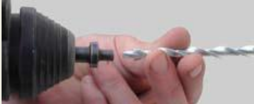
2 nd Generation Engineered "Precise Pitch" Product Upgrade.