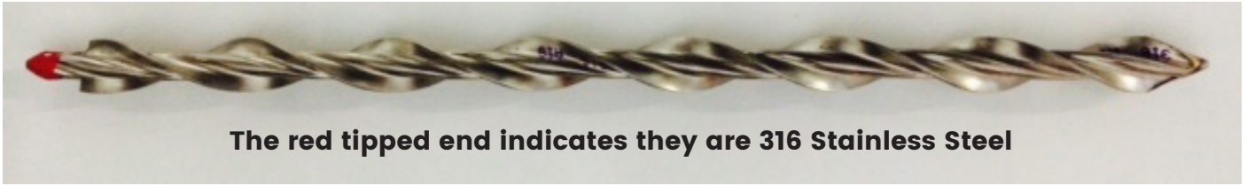
The red tipped end indicates they are 316 Stainless Steel