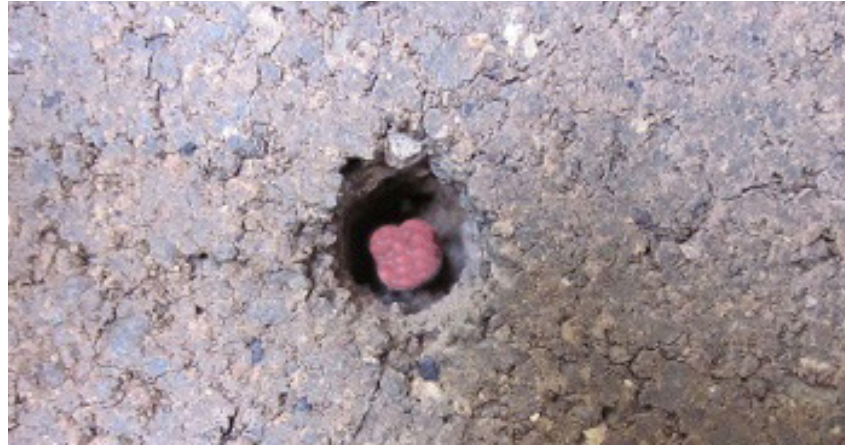
9mm CD Tie installed using SDS countersunk CD Tie Tool. Note: the red tip of the 9mm CD Tie unique to Thor Helical indicating 316 SS.