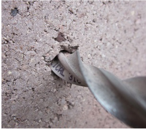
CD Tie installation